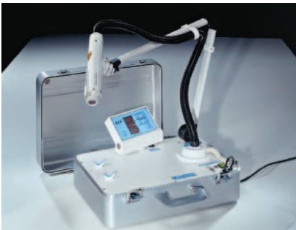
Figure 1. FriendlyLight ® Er:YAG laser.

The technique of applying a tailored number of 5–6 J/cm 2 300 \mu s pulses of this portable Er:YAG laser to small areas appears to be safe and effective. The re-epithelialization was complete in 2–7 days depending upon the number of passes. The average duration of intense erythema was 7 days. The blending of the treated and untreated areas in terms of skin color and texture was evident in less than 2 weeks. The patients reported mild to moderate discomfort and the level of satisfaction was reported to be high. (Figures 2–3.)