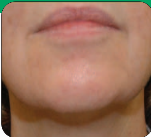
Photo- Rejuvenation with Skin Tightening